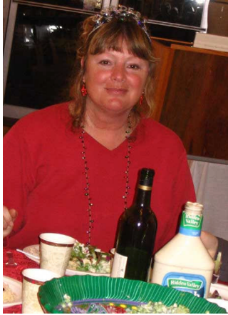
The "fly Goddess"

jeweled "goddess crown", only the jewels are dead flies. Zette IS the "pasture fly goddess!"