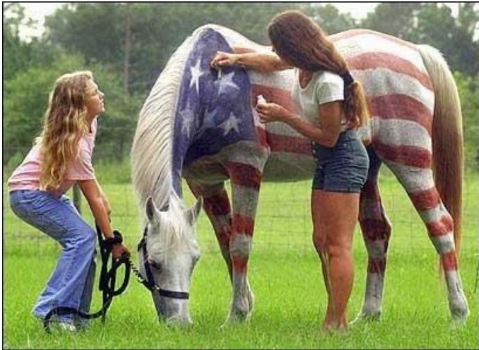
Belated Happy 4 th of July

July 21 – MHA potluck/meeting at the arena Picnic and Presentation at 6. Meeting at 7 August 18 –MHA picnic/meet at arena September 15 – MHA picnic/meet at arena September 17 – 20 – Camp trip to Jack Brooks October 20 – MHA meeting at Laura Stetsons October 24 – Trail User Appreciation Day November 17 - MHA meeting December – Holiday party at Shivani & Daniel's