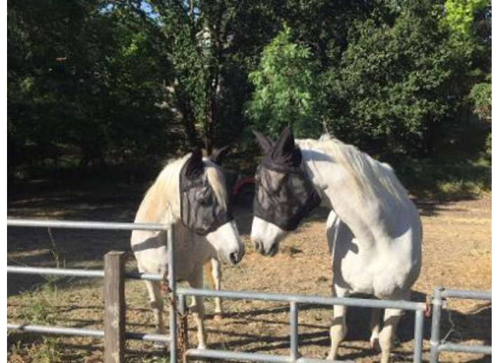
Dude, you have a mask on!

As always, timing is flexible when Austin comes to work. He never rushes a horse or finishes up until the horse is ready, so we may or may not get on with the meeting exactly at 7.